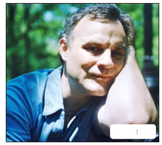
Don't expect anything groove oriented, blissed out, or pleasant as background music.

If it thinks about it at all, popular opinion may hold that just intonation– the use of purely consonant tunings based on the overtone series–is the provenance of math geeks with synthesizers. But every major new acoustic work in pure tunings kicks a few slats out of that box, and Downtown vocalist Toby Twining has produced an hour-long work that is one of the most original such things since Harry Partch. His Chrysalid Requiem , premiered here in 2000, has just appeared on a disc from Canteloupe, the new label from the Bang on a Can festival. It is an actual requiem, in Latin, a capella , and suitable for church use, which puts it in a tiny select company of American experimental liturgical works including the masses of Ben Johnston and Salvatore Martirano and the remarkable Missa Umbrarum of Daniel Lentz. Probably not coming soon to a Catholic church near you.